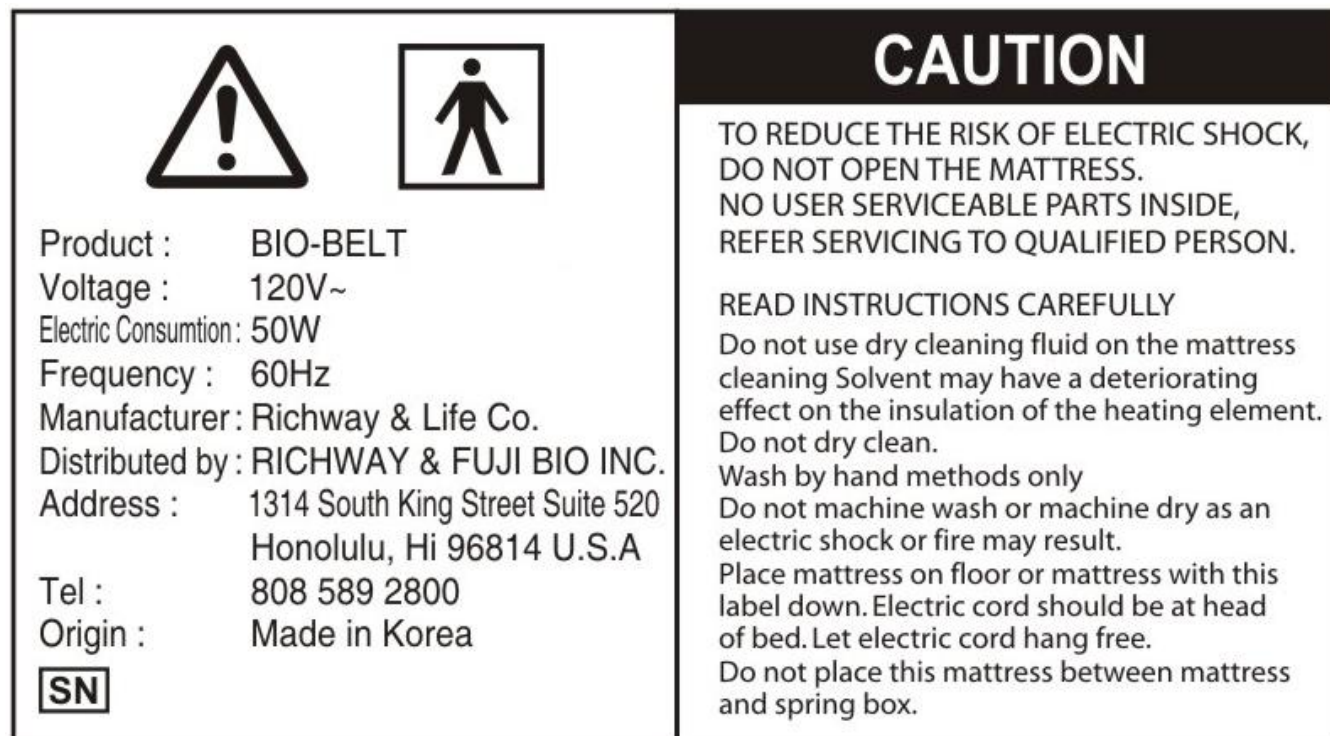
Illustration 3 – Mat Label Drawing